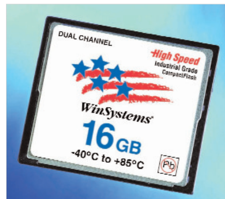
WinSystems' Industrial CompactFlash Card

CompactFlash - A connector is on the board that will accept both Type I and II CompactFlash (CF) cards. The connector is wired to the IDE controller. A designer can use CompactFlash cards as data storage for applications where the environment is too harsh for rotational hard disks. The EBC-Z5xx can boot directly from a CompactFlash device.